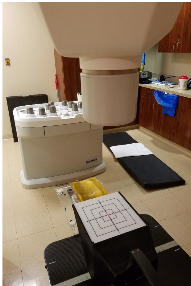
Figure 3 – The Falcon is shown sitting on the patient couch with the CyberKnife laser pointed at the target center.

X-ray fluence images were captured for the 12 Iris apertures using the Falcon’s BeamWorks Strata software. The software measured 72 FWHM diameters at 5 degree intervals on each beam spot in order to develop the average.