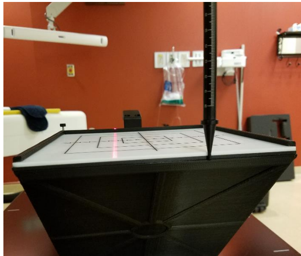
Figure 2 – The couch vertical position is used adjust the height of the Falcon so that the scintillator surface is 800 mm from the virtual source of the CyberKnife Linac.

X-ray fluence images were captured for the 12 Iris apertures using the Falcon’s BeamWorks Strata software. The software measured 72 FWHM diameters at 5 degree intervals on each beam spot in order to develop the average.